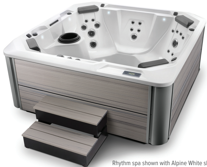
Rhythm spa shown with Alpine White shell, Almond cabinet and Almond Hot Spot Collection Step.